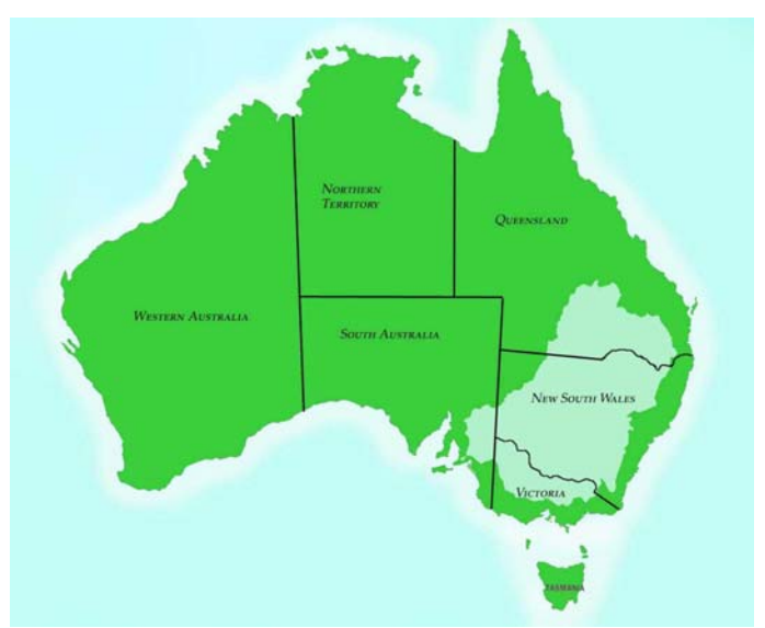
Figure 1: Murray Darling Basin (Murray Darling Association, 2007)

Rivers and aquifers are transboundary resources, and the most prominent example is the MDB. The major river system running through the basin, the Murray-Darling, is Australia's largest and one of the world's major river systems. The basin comprises 14 percent of Australia's total land mass across four states. It is an important bioregion: within it is found over 30,000 wetlands some of which are listed under the Ramsar Convention of Wetlands of International importance. Irrigated agriculture in the Basin has had a history of over 140 years and accounts for an estimated 70-72 per cent of all irrigation water use in the country.